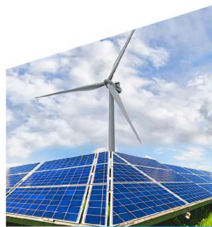
POWER & ENERGY INDUSTRY